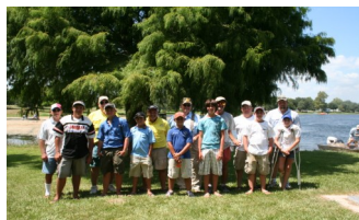
Youth Division Tournament III Coletto Creek Reservoir August 14, 2010

Thank you to everyone who made this season possible.